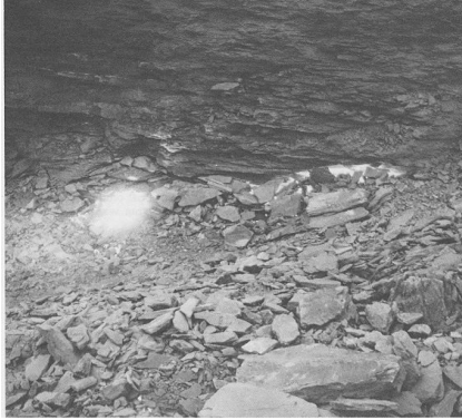
Centralia Coal Fire